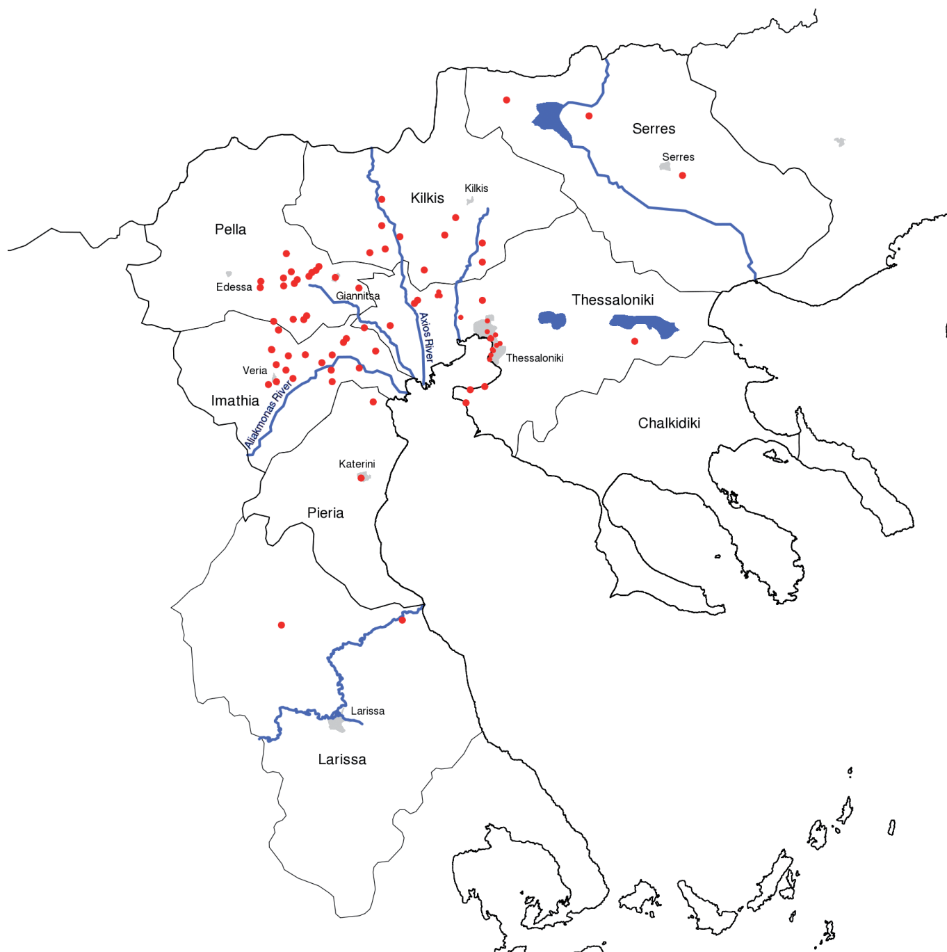
Place of residence of reported cases of West Nile neuroinvasive disease, Greece, 1 July – 22 August 2010 (n=80) a